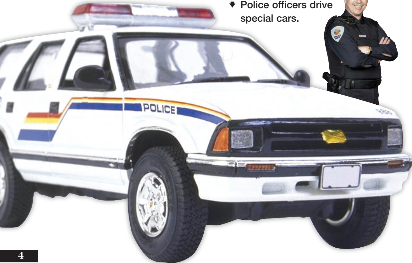
↓ Police officers drive special cars.

Police officers are people who are trained to “protect and serve.” That means they help keep people safe. It also means they help make sure that people obey laws . Police officers work in small towns and big cities. They drive cars, walk, and even ride bicycles and horses.