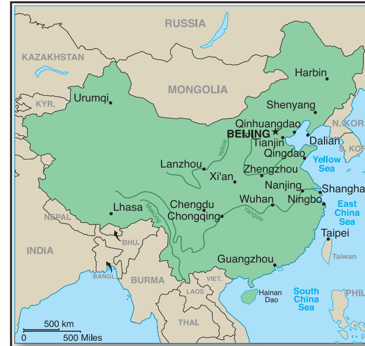
▲ China today