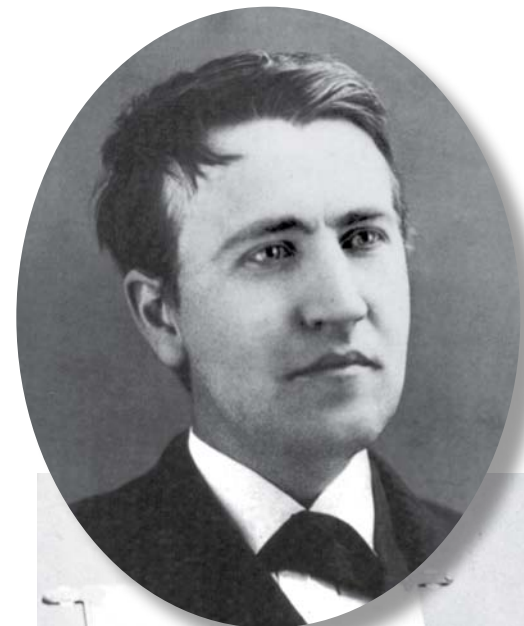
← Edison as a young man

When an inventor creates something new, he or she wants to be sure no one else will use his or her idea. Inventors apply to the government for a document called a patent . A patent protects an inventor's ideas. Thomas Edison holds the record for the most patents for new inventions. He holds over 1,000 in the United States!