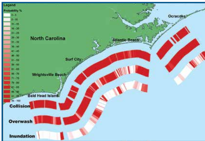
Probability of collision, overwash, and inundation for Hurricane Irene

Directions: Observe the image, and answer the questions.